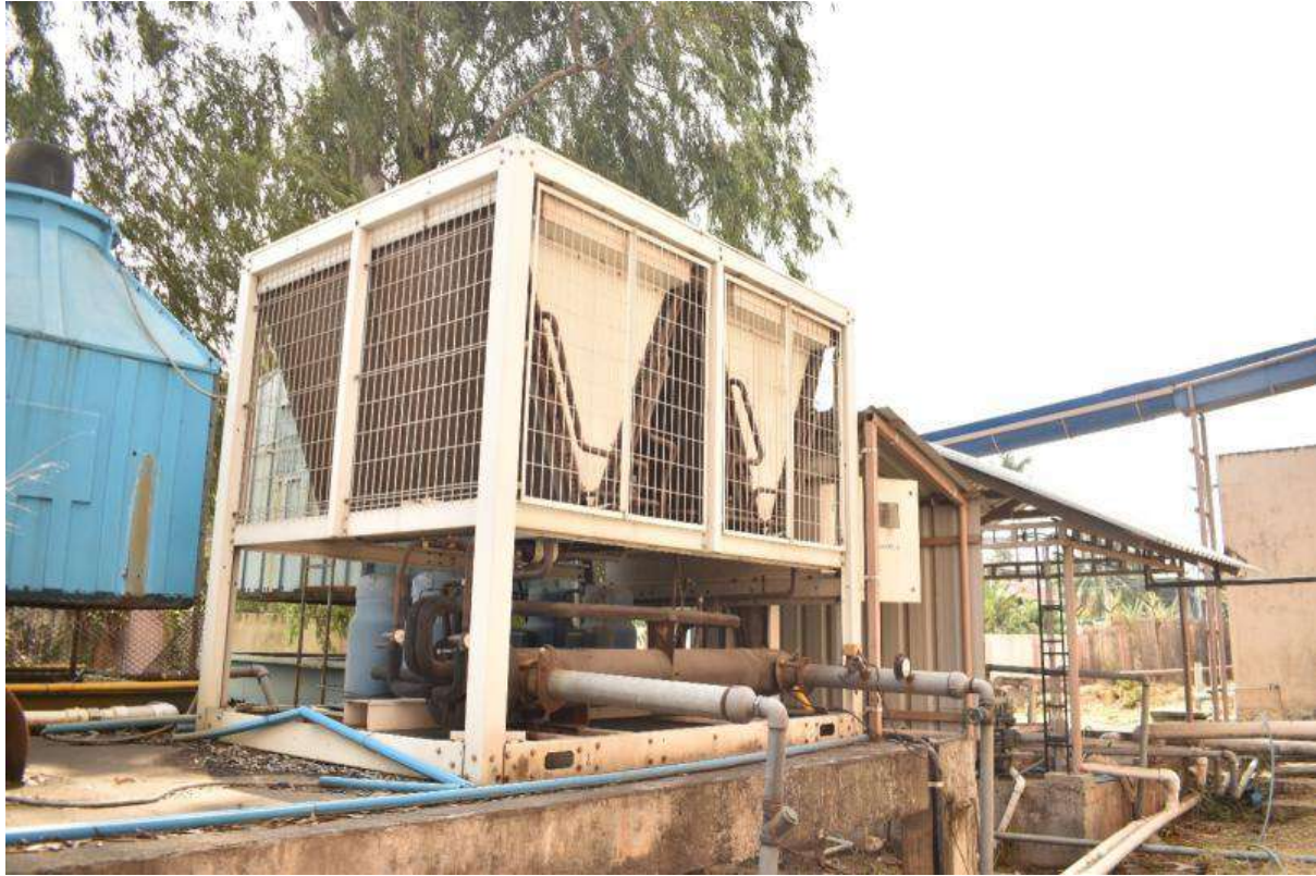
Fig. 11 Air Colled Chiller (Make: Blue Star, 40T)