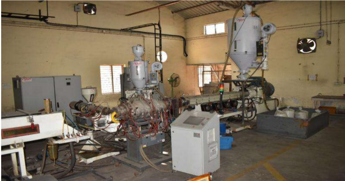
Fig. 1 Extrusion Line 1