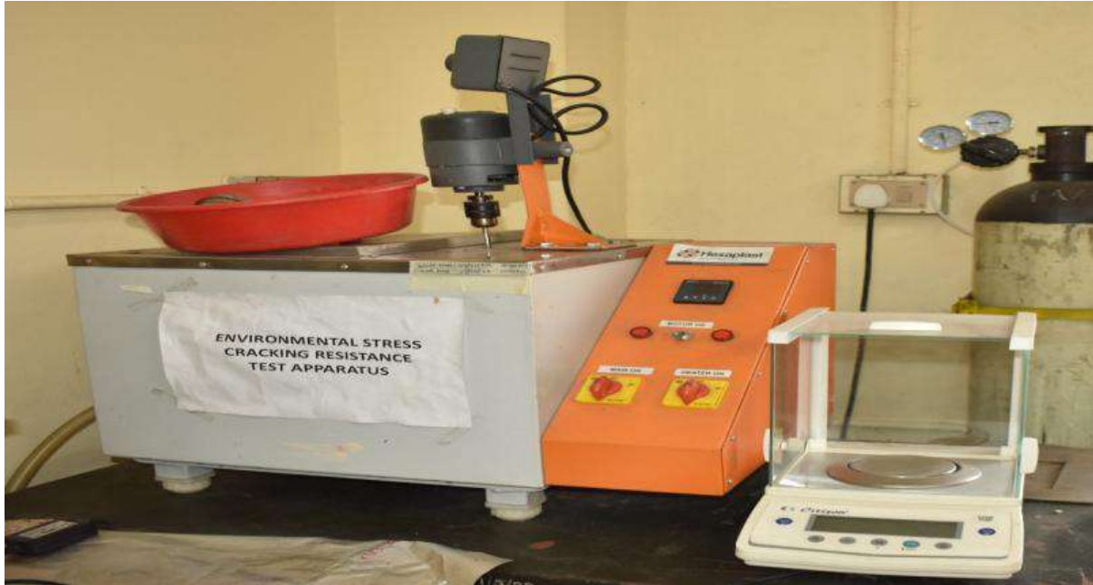
Fig. 19 Environmental Stress Cracking Resistance Apparatus and Weighing Balance