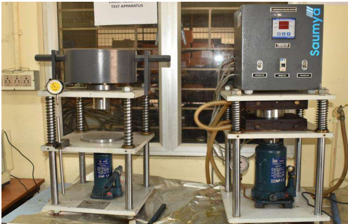
Fig. 20 Crush Resistance Apparatus and Compression Press