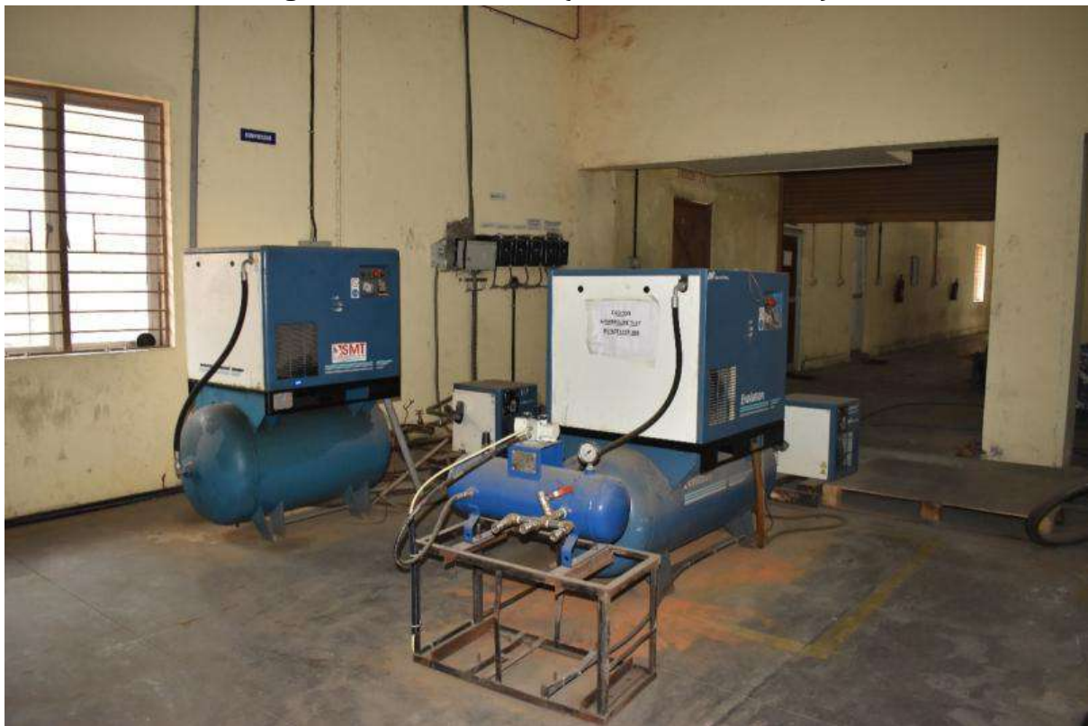
Fig. 12 Air Compressor (Make: Ingersoll Rand)