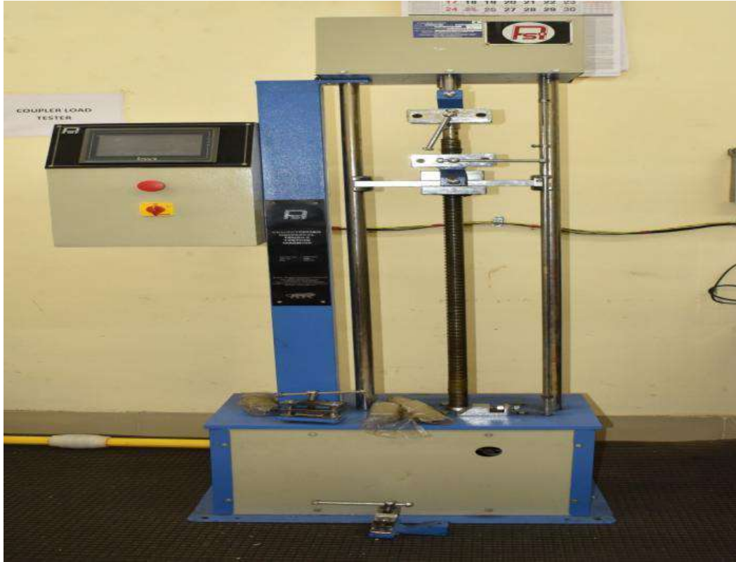
Fig. 15 Universal Tensile Testing Machine