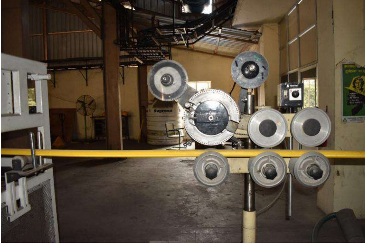
Fig. 7 Hot Stamping Printer (Make: Aeromec)