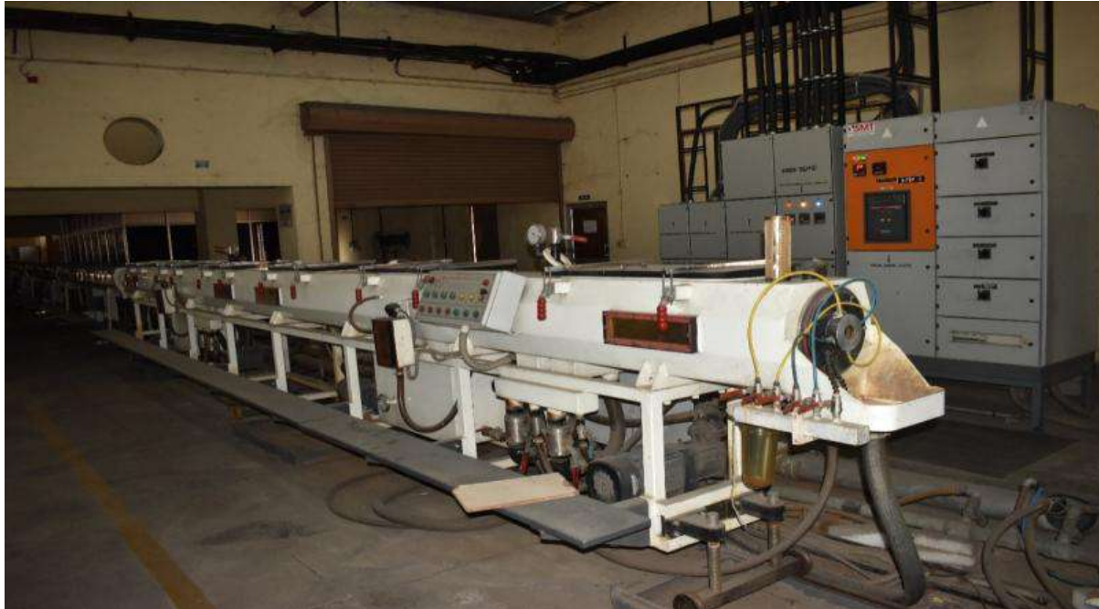
Fig. 3 Vacuum Tank