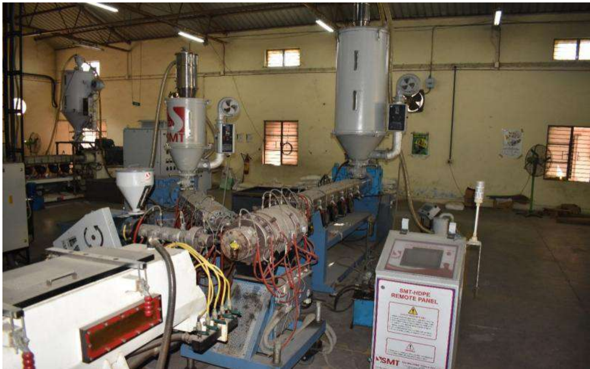
Fig. 2 Extrusion Line 2