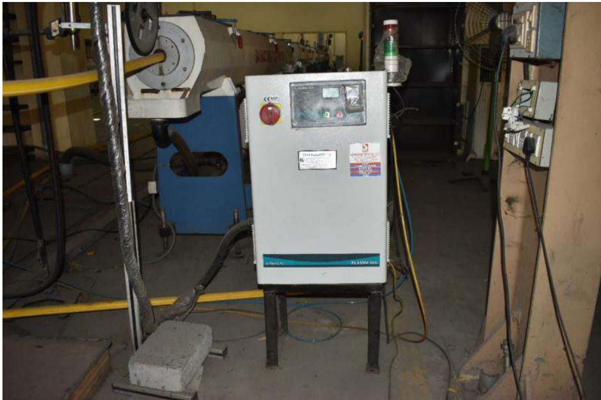
Fig. 6 Plasma Treater