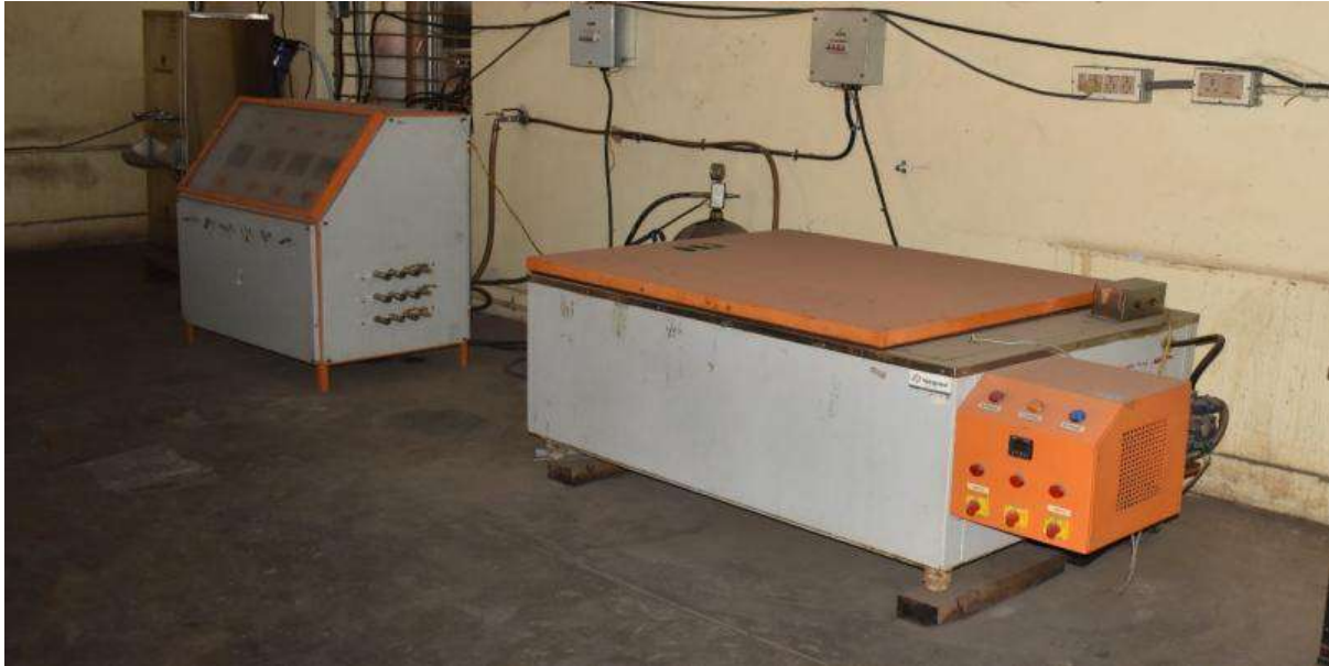
Fig. 13 Airless Hydrostatic Pressure Tester