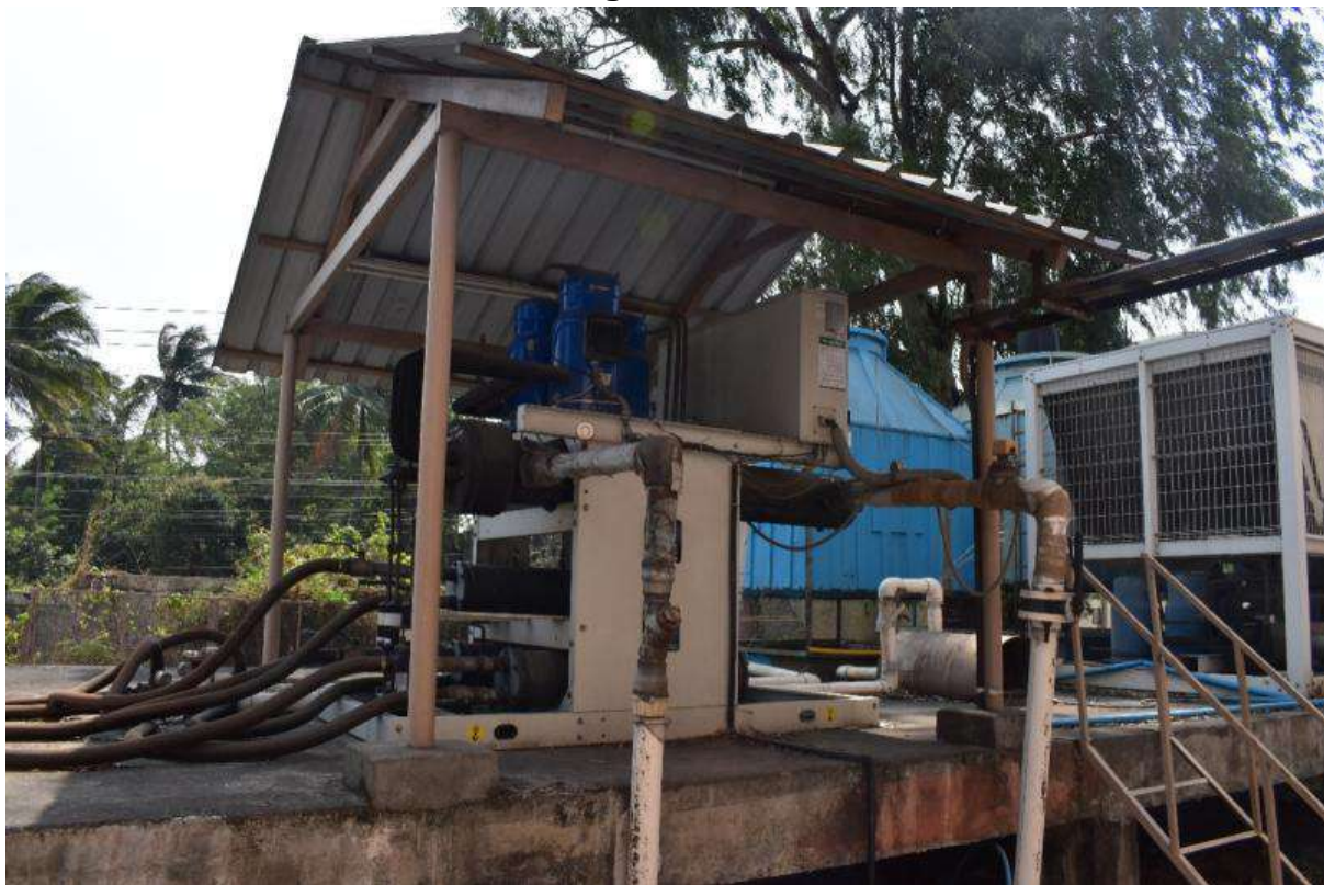
Fig. 10 Water Cooled Chiller with Cooling Tank (Make: Blue Star,40T)