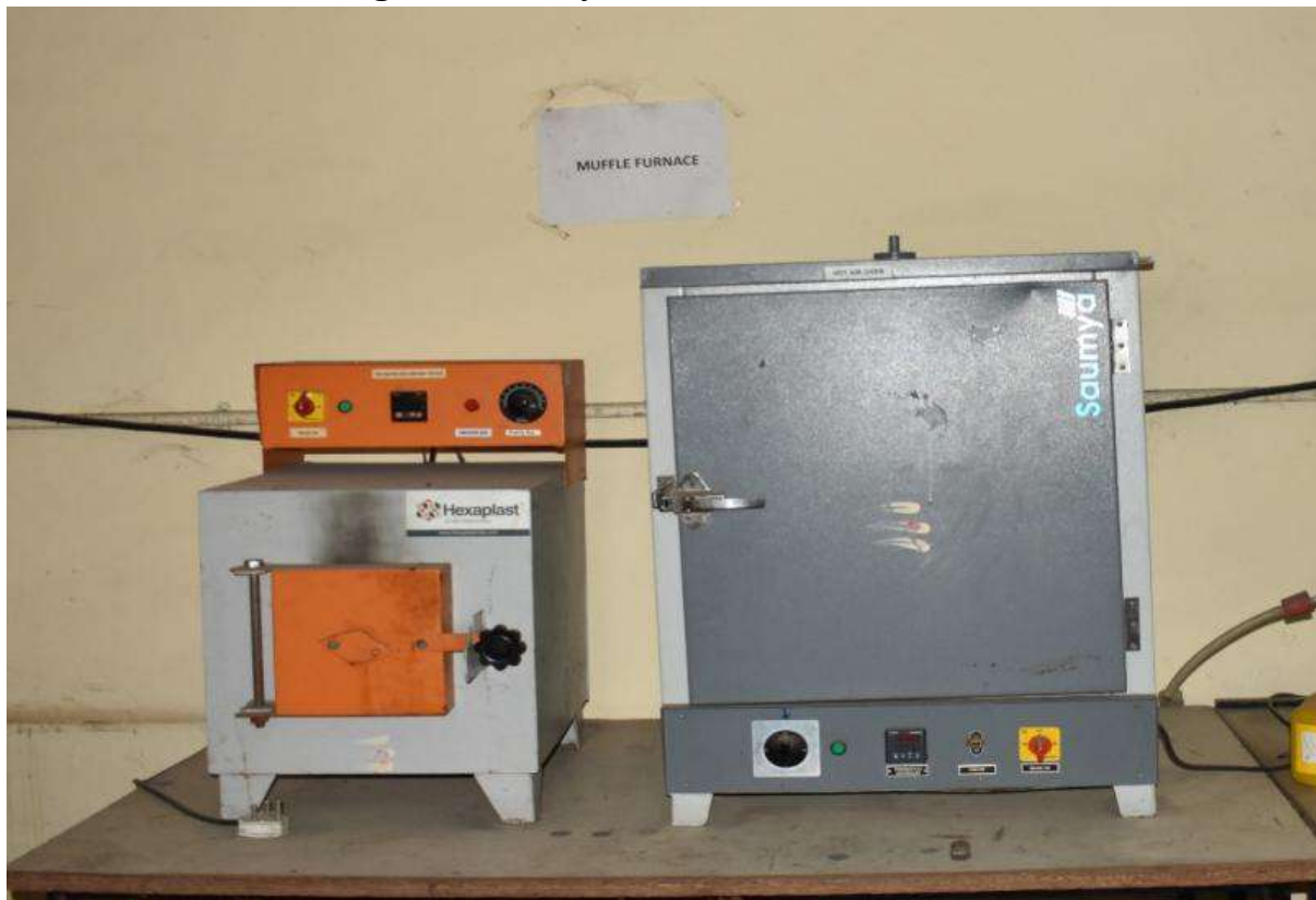
Fig. 14 Muffle Furnace and Hot Air Oven