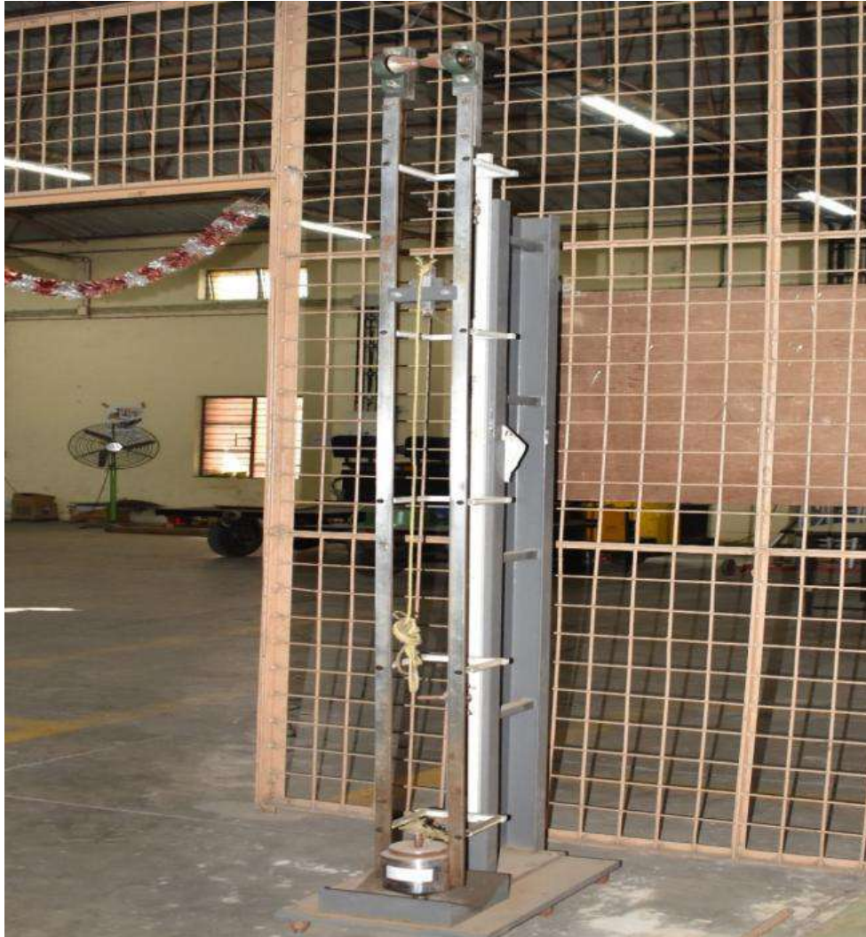
Fig. 21 Impact Tester