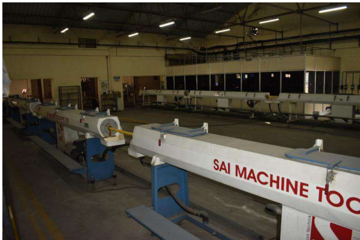
Fig. 4 Cooling Tanks Line 1 &2 (4 no's each)