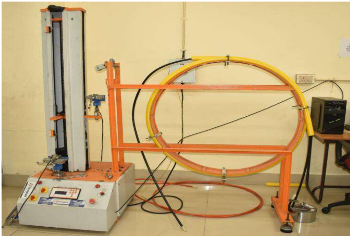
Fig. 16 Universal Tensile Testing Machine with ICOF Testing Attachment