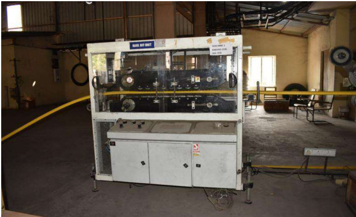
Fig. 8 HAUL OFF UNIT