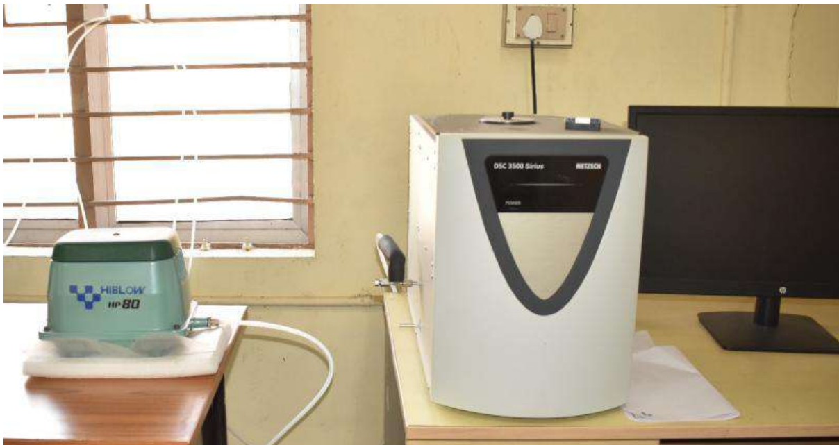
Fig. 18 Differential Scanning Calorimeter with Cooling Compressor