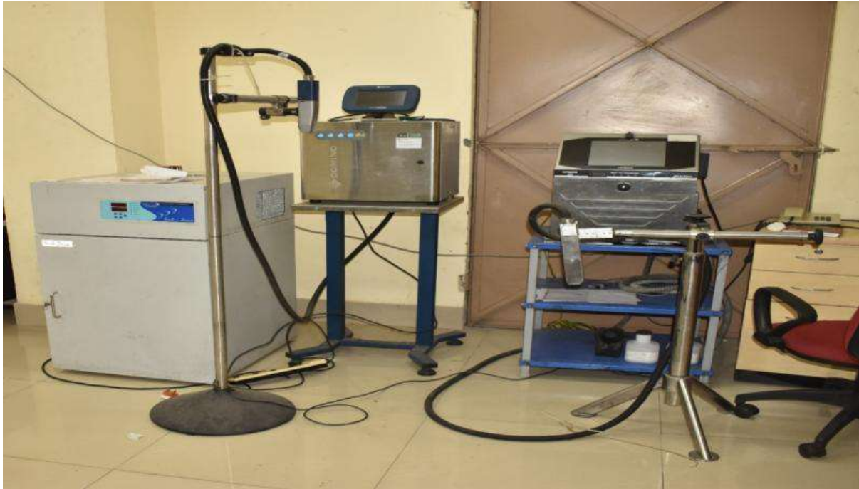
Fig. 5 Ink Jet Printers (Make: Hitachi & Domino)