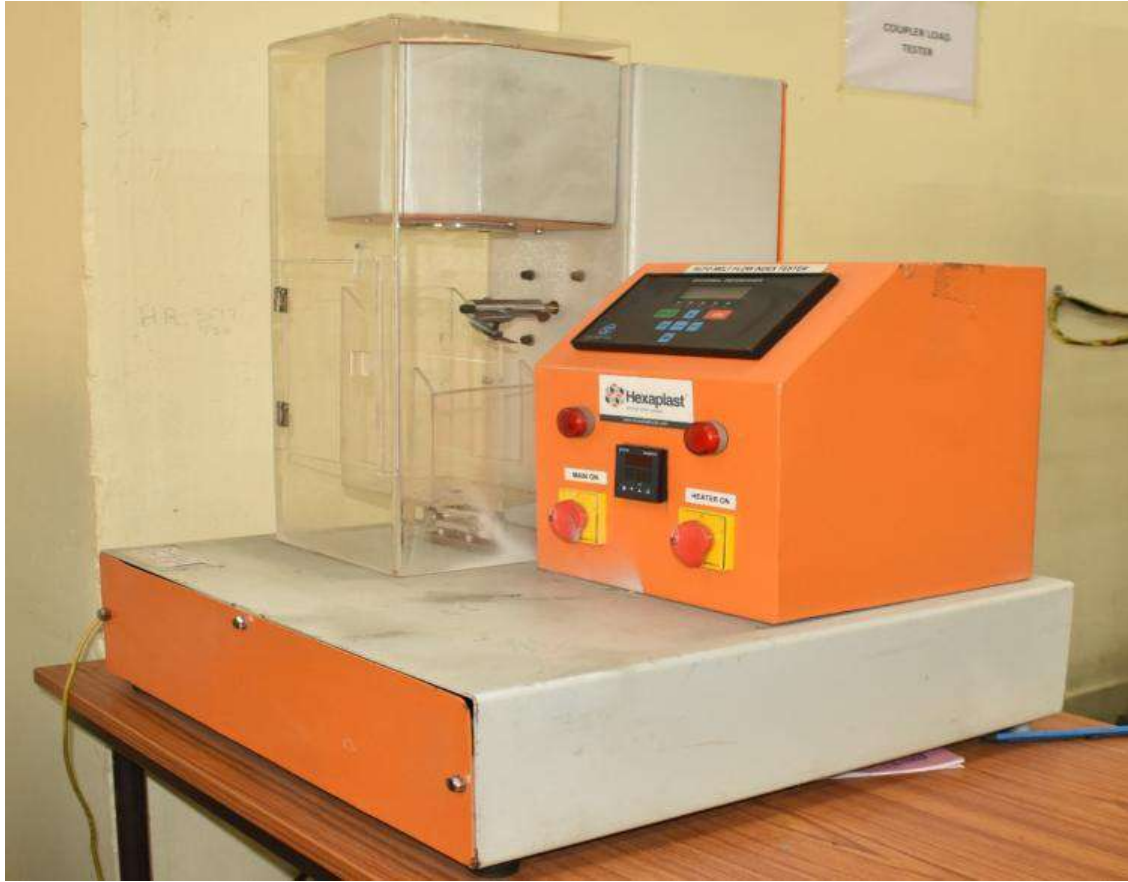
Fig. 17 Melt Flow Index Tester