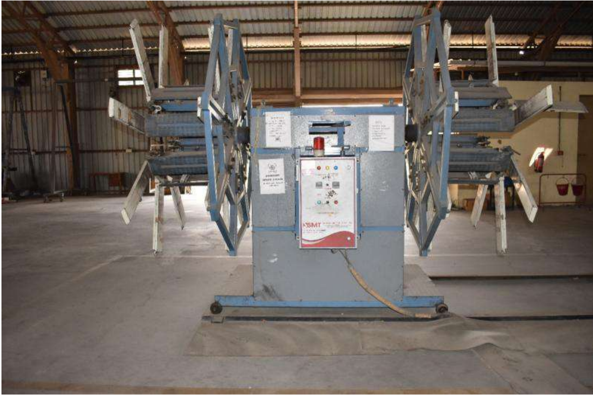
Fig. 9 Coiler